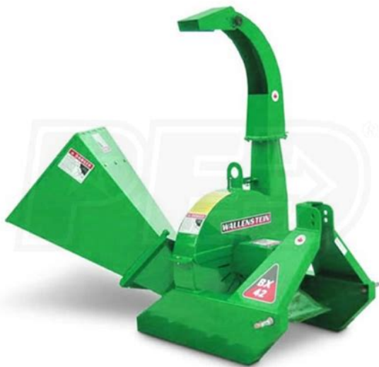
Actual Colors May Vary